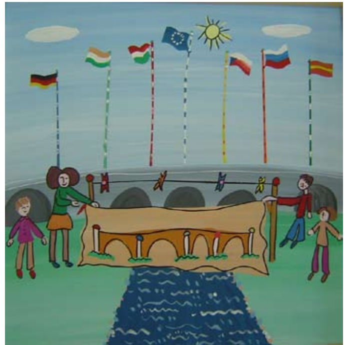
Painting activities develop: communication-integration creativity.