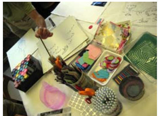
A lot of materials can be used in the workshop